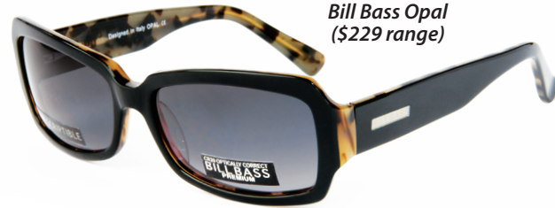
Bill Bass Opal ($229 range)